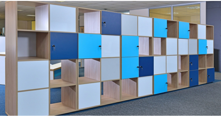
Ref: TAF Stak Cube Storage