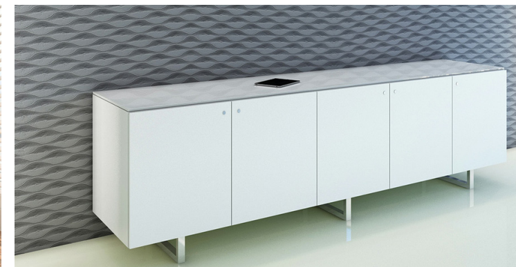
Ref: WH Credenza Storage