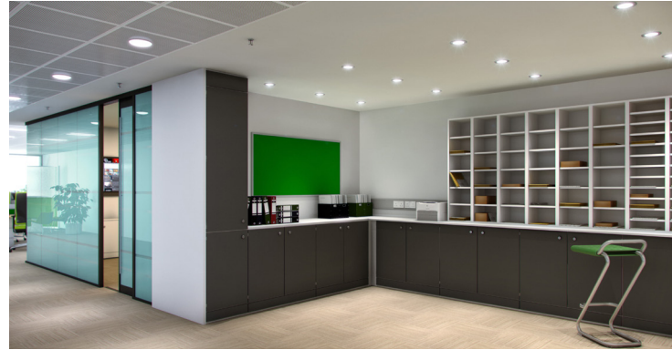
Ref: FG Postroom Furniture