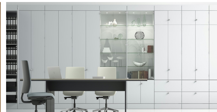
Ref: TF Storage Wall