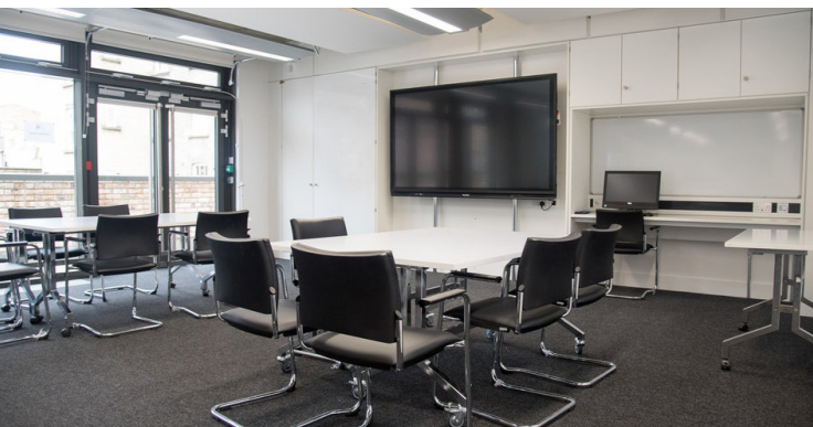
Ref: PP Meeting Room Storage

No matter how preliminary your brief may be, we can incorporate as much or as little detail as you need into the finished project. From accent lighting and LED lighting, through to logo design and branding and even access control, our affordable office storage solutions work for you.