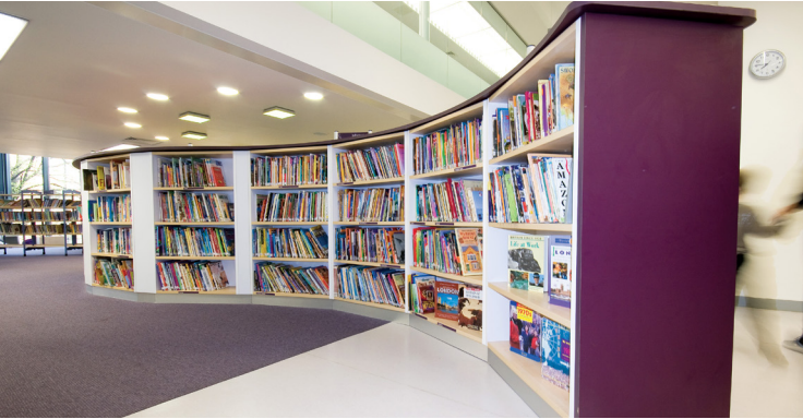
Ref: FG Bespoke Library Shelving