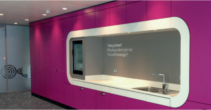
Ref: SP Teapoint Storage