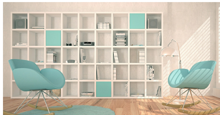
Ref: TAF Stak Storage