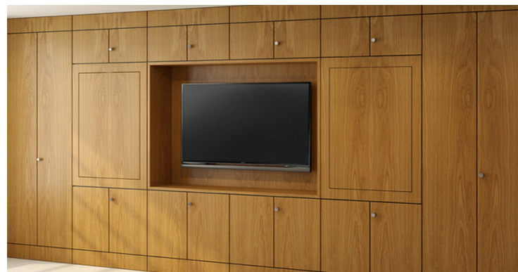
Ref: TF Media Storage