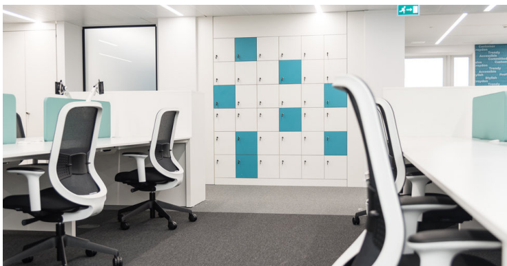
Ref: PP Locker Wall

High quality workmanship combined with the finest natural and man-made materials come together to create the most beautiful yet durable reception desk solutions available in the UK today.