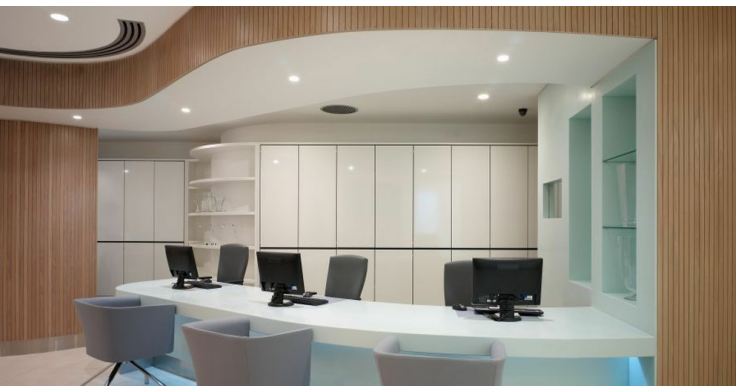
Ref: SP Bespoke Storage