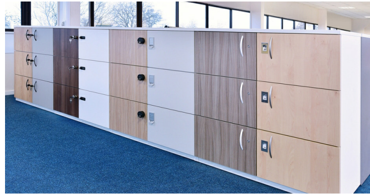
Ref: TAF Bespoke Lockers