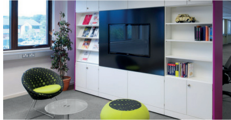
Ref: SP Media Storage